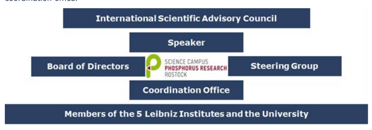
Figure 4. Structure of the Leibniz ScienceCampus Phosphorus Research Rostock

The Institute for Baltic Sea Research Warnemünde acts as beneficiaries and provides the coordination office.