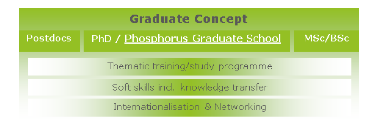
Figure 1. Graduate Concept of the Leibniz ScienceCampus Phosphorus Research Rostock

The structured training concept of the P-Campus (see figure 1) is realized by graduate studies at the Graduate School of Phosphorus Research and the involvement of other young scientists (BSc and MSc students, doctoral students, and postdocs) whose thesis or project concerns phosphorus research. All relevant information are provided to young scientific members of the P-Campus. In addition to their inclusion in events involving the P-Campus and in scientific and thematic networks, for example, those of the DPP and ESPP, they can apply to the P-Campus for grants and for financial support for internationalization (travels, publications and visiting scientists, including longer stays).